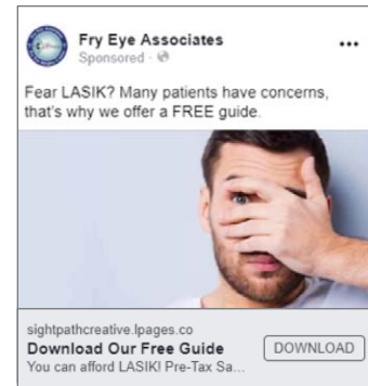
Facebook ad and landing page