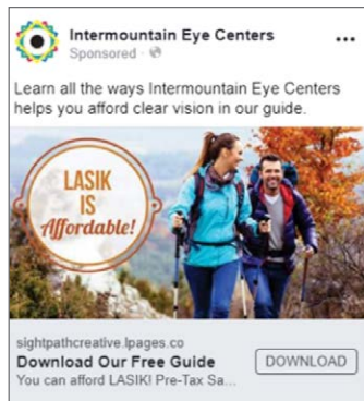
Facebook ad and landing page