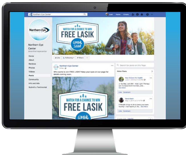
Facebook homepage for clinic