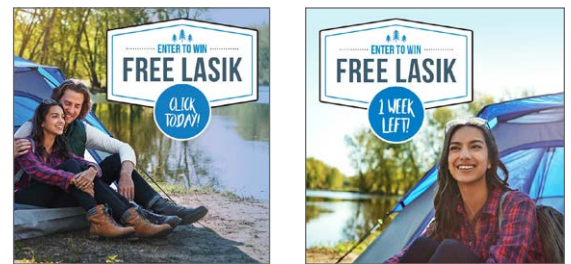
Example of Facebook posts