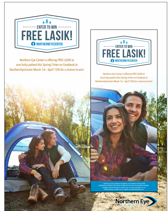
Printed counter cards and buckslips for clinic advertising

Contact us to customize a campaign for you today!